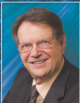
Founder REINHARD BONNKE